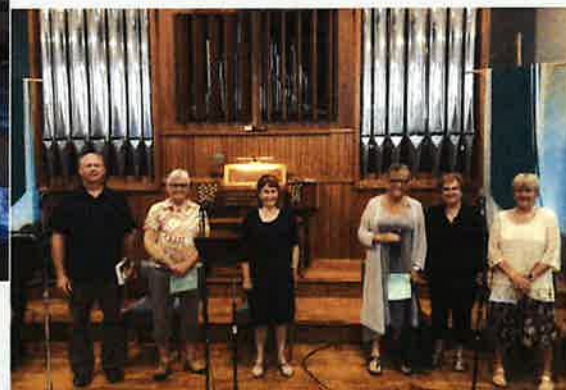
CLC Vocalists, leading the congregation in song