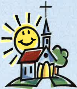
Central Lutheran Church Sunday School