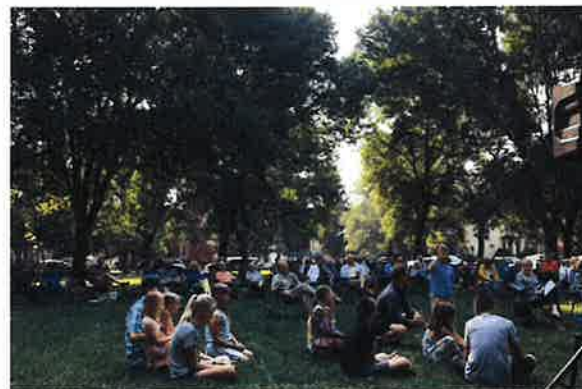
Worship Service at Sinclair Park

The month of September brings about a series of transitions and a return to routine. We transition from summer travels and spontaneous gatherings to schedules and weekly commitments. As a church body, we mark and celebrate annual events such as blessing of the backpacks, distribution of Bibles, and installation of Sunday school teachers. There is a comfort in the familiarity of these annual events as well as a sense of anticipation. New to the church schedule for this fall are the activities surrounding the 150 th Anniversary Celebration. We have many reasons to gather together this September in celebration of all that was and is and in expectation of all that is to come. September will be a very full month at Central Lutheran, and I hope that you will join us as you are able!