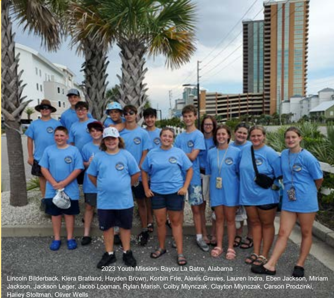
2023 Youth Mission- Bayou La Batre, Alabama :

"Gathered in the love of God, we connect and serve."