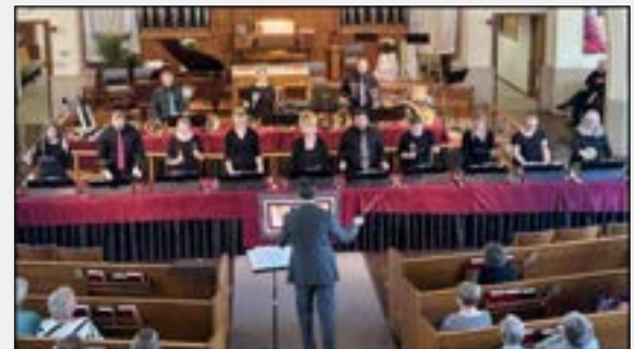
Rochester Area Handbells performing on May 13 th