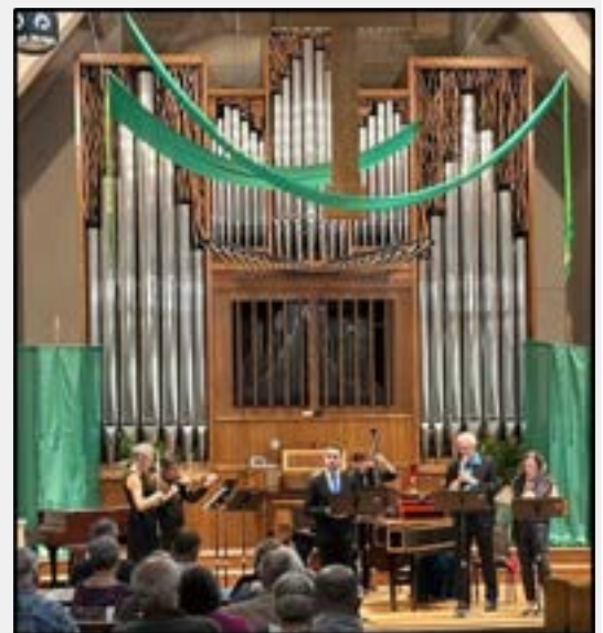
Our magnificent Hendrickson Organ at the recent Bach Society of MN performance